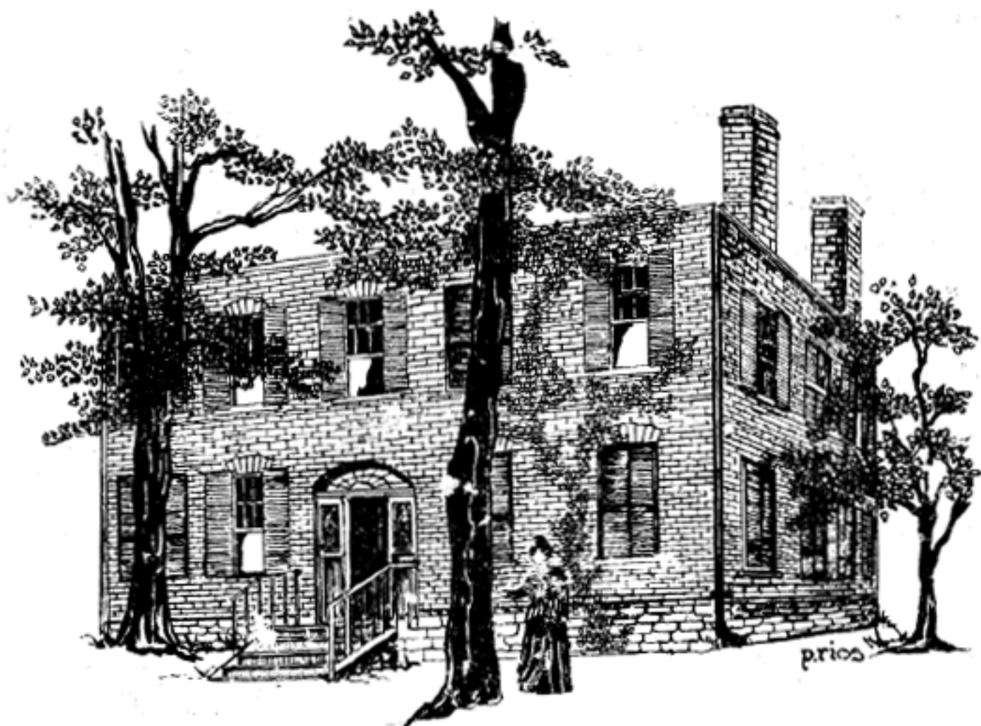
The Abraham Dox Home, 1825