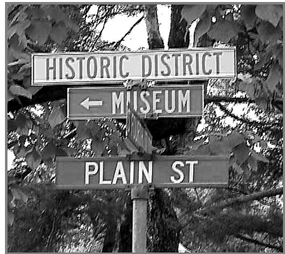
Signage provided by the Village of Lewiston.

On the other hand, where the City of Schenectady Historic District Commission required several measures, including planting 38 arborvitae trees eight feet in height in order to screen a proposed large above-ground swimming pool in an historic zoning district, the requirements were upheld by the Appellate Division. 15