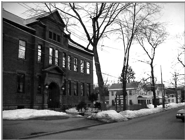
A former public school has been rehabilitated for use as a private school in the City of Saratoga Springs.

ordinance prohibited educational uses from locating in its “Single Family Historic District,” which encompassed the “General Electric Realty Plot,” a distinctive nine-block area of 120 homes developed at the turn of the 20th Century and listed on the National Register of Historic Places. The Court held that because of the competing public policy interests in education, such uses should not be foreclosed from locating in a residential zoning district, even a historic one. The Court further held that there must be a case-by-case deliberative process in which “proposed educational uses must be weighed against the interest in historical